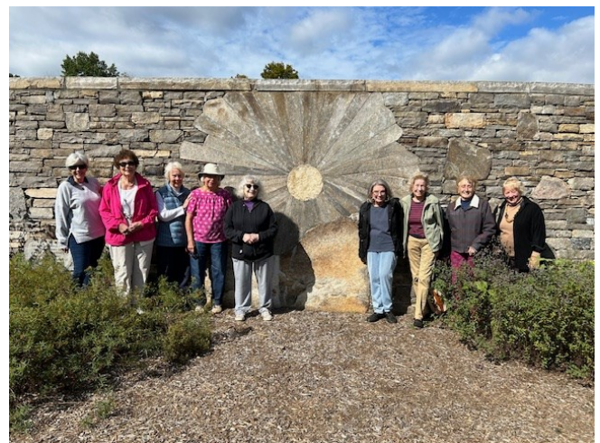
NWC Members at the Catherine Violet Hubbard Sanctuary

The Finance Committee has set the Operating Budget for this year. Please see the proposed budget in this Newsletter. There will be a vote by the membership to approve the budget at the meeting.